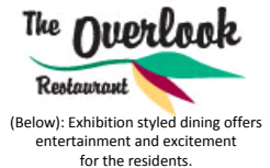
(Below): Exhibition styled dining offers entertainment and excitement for the residents.