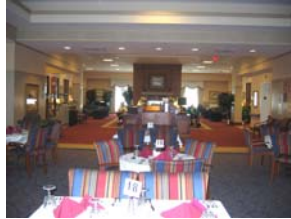
(Left): This American style dining room offers a pleasant and comfortable living room area for residents waiting for a table.